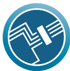
Wire Harness & Cable Assembly