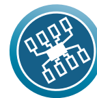
Circuit Board Assembly